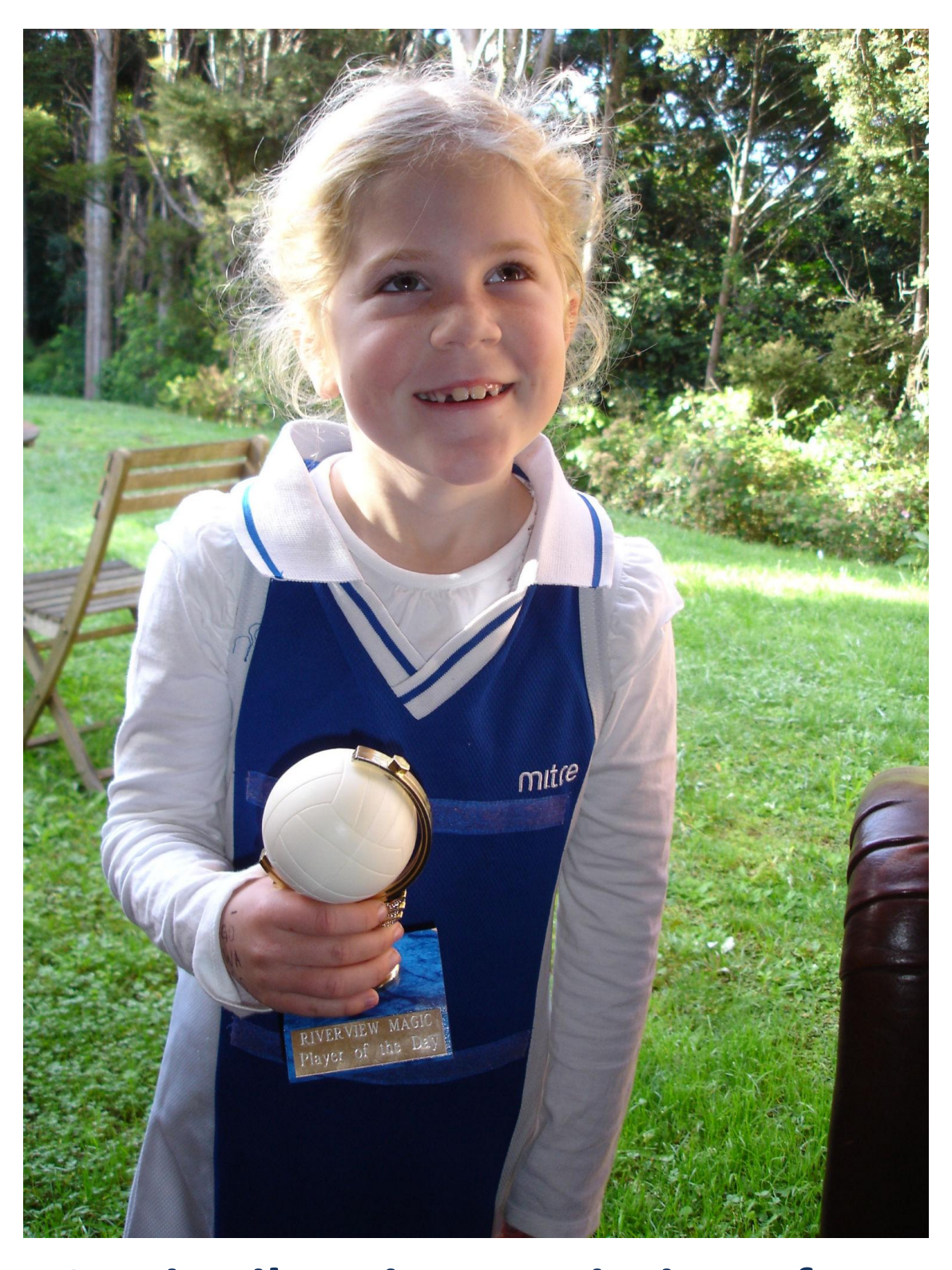
Cystic Fibrosis Association of NZ ANNUAL REPORT 2012