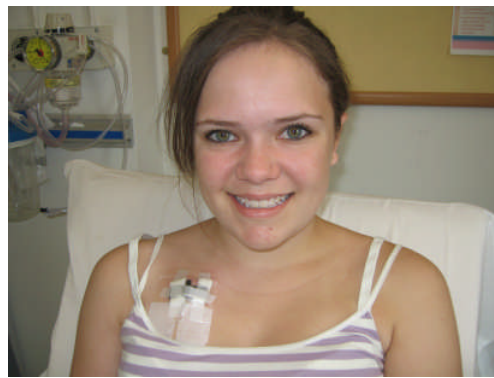
With needle in place for treatment