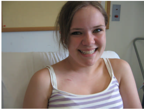
Before insertion of needle