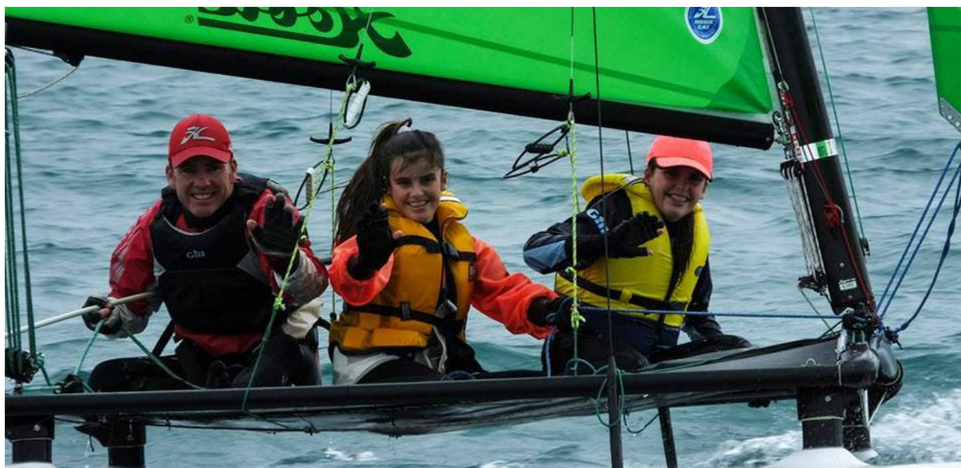
Participants of the Sail4CF event held at Manly Yacht Club on the North Shore, Auckland in October 2015

We received a grant for more sterilisers from the Lions Foundation. And we have also received some private donations from our greater CF community.