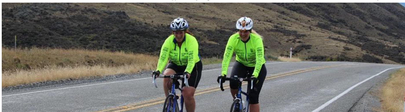
Supporters cycling to raise funds for CFNZ Canterbury at the Central South Island Charity Bike Ride

A huge thank you to all the groups and individuals who have raised money for CFNZ this financial year. We've seen an amazing spirit and determination from our supporters - all in the aid of helping to improve the lives of people with CF. A special thank you also to all our regular donors - your generosity has made a huge difference. Donations go directly to supporting the CF community.