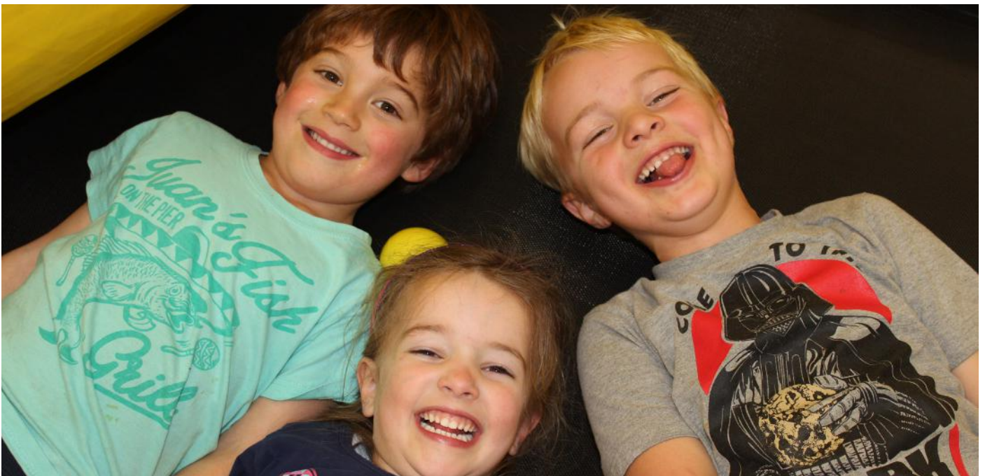
Grey Lynn Preschoolers having a ball at 'Bounce 4 CF' at Uptown Bounce, an event sponsored by Choice Hotels

Passionate engagement Knowledge is power Creating community Innovate