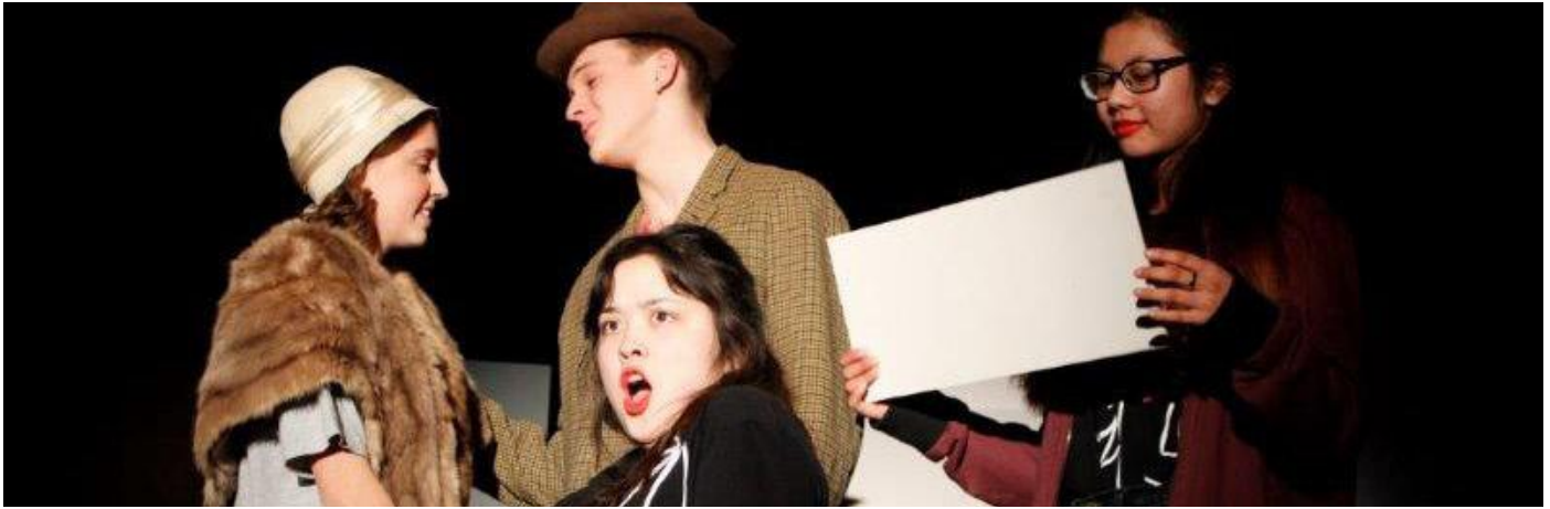
Woodford House School performed 'John Lennon and Me', a production centred around a young woman who has cystic fibrosis