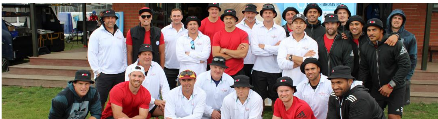
The BNZ Crusaders Super Rugby Team played ball for Cystic Fibrosis at Charity Cricket in December 2015