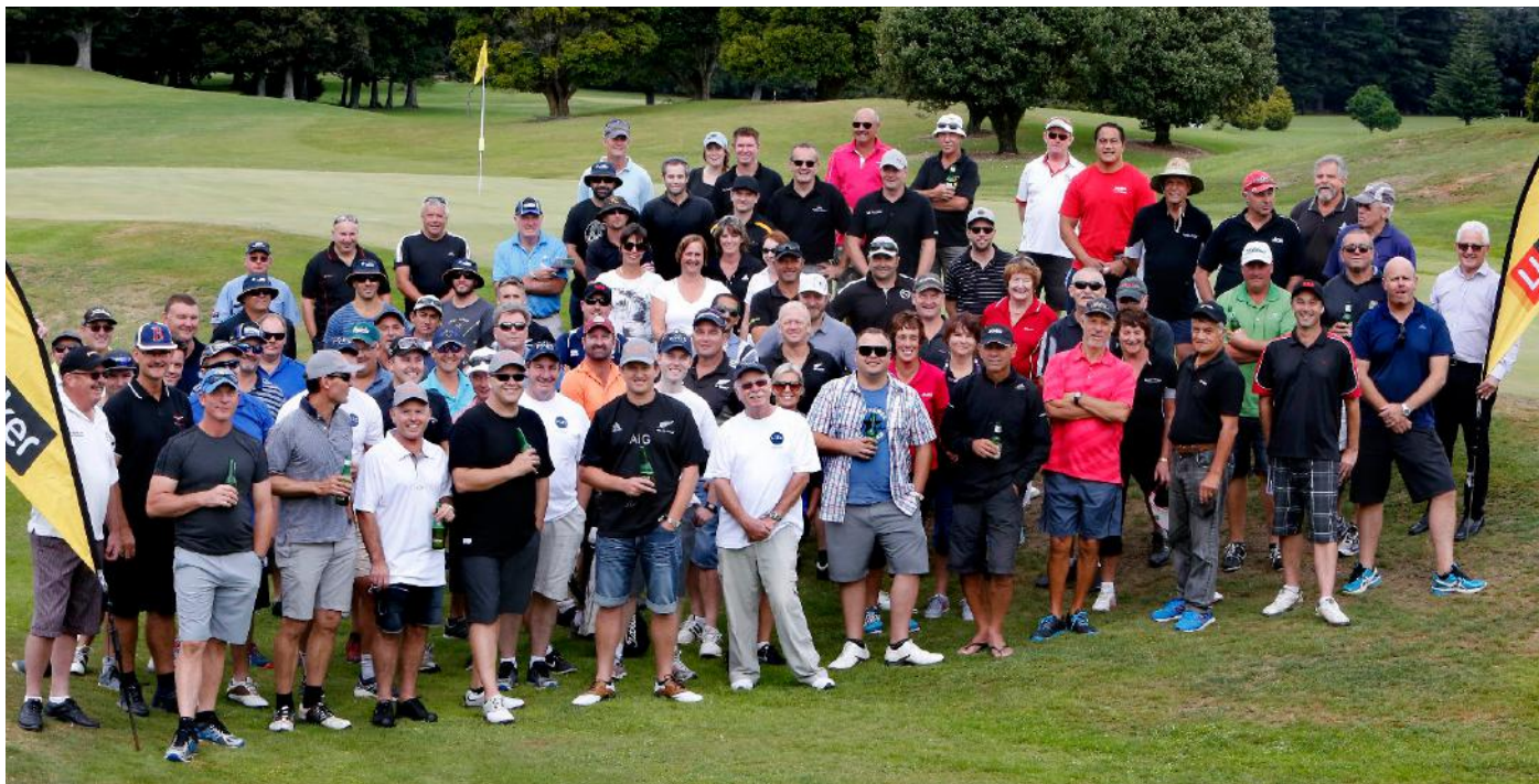
A winning year for CFNZ Northland with it's ninth charity golf tournament held in April 2016