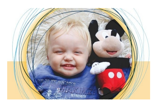
New CF Resources Available